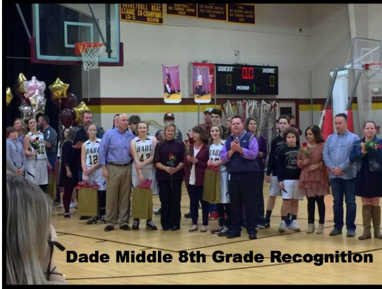
Dade Middle 8th Grade Recognition